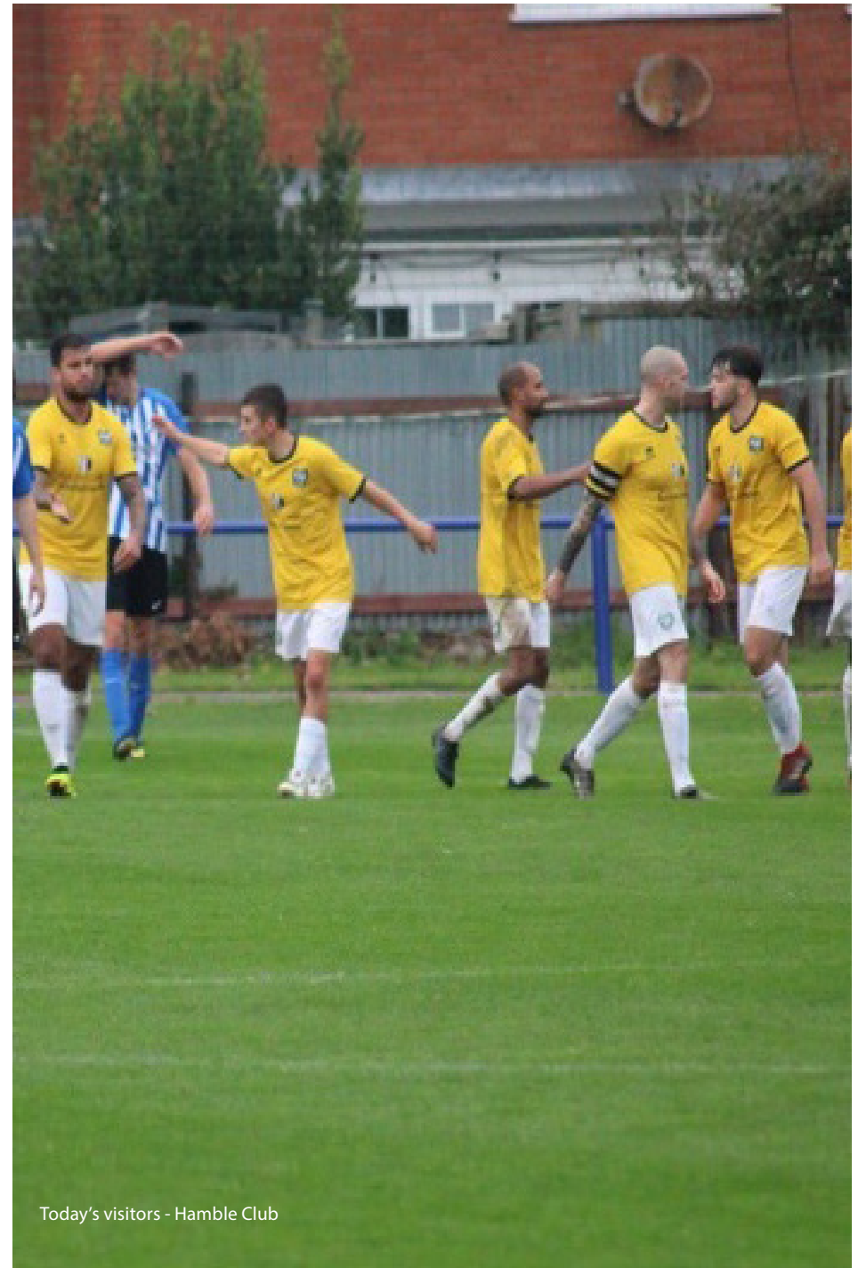
Today's visitors - Hamble Club