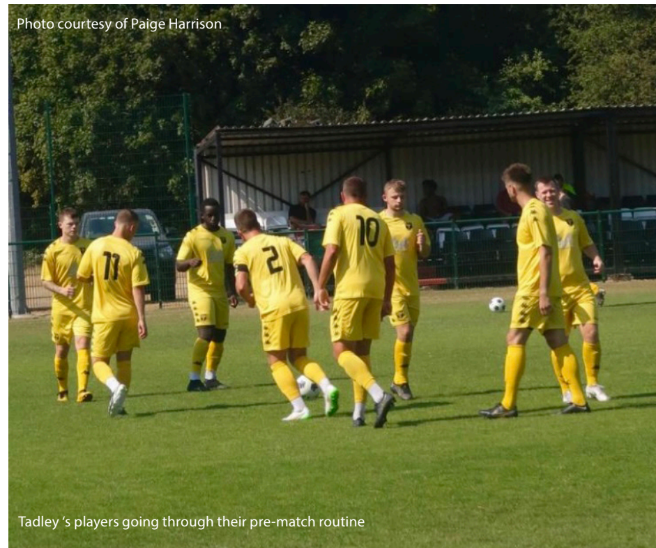
Tadley's players going through their pre-match routine