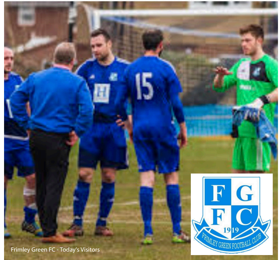
Frimley Green FC - Today's Visitors